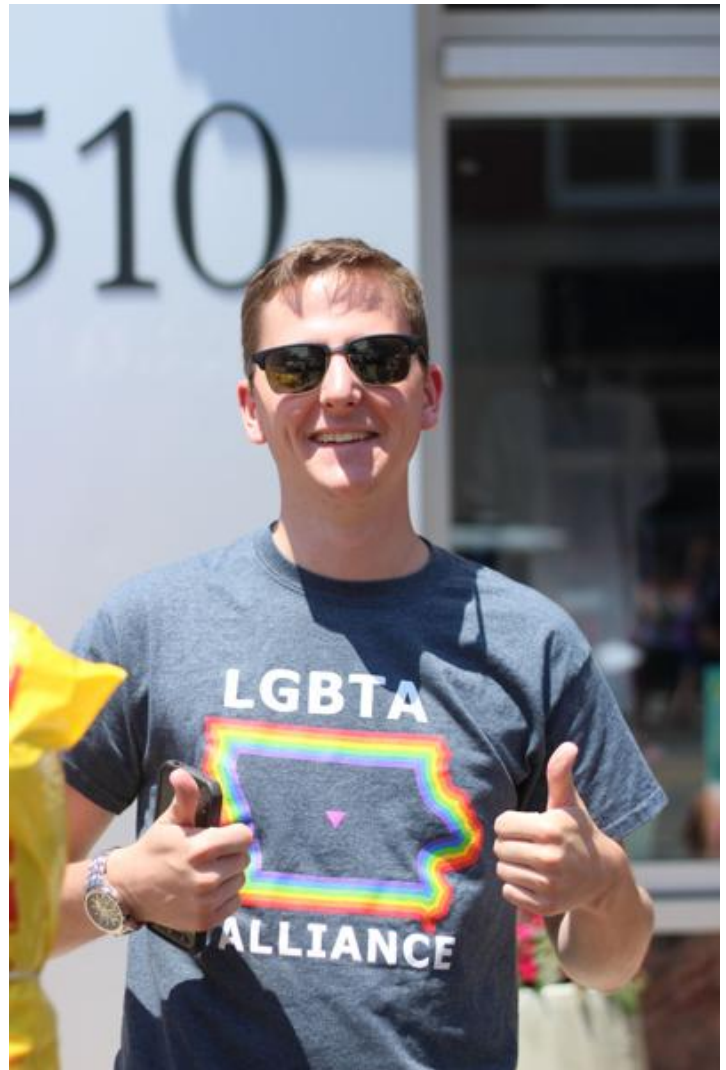
Vice President of the Student Body poses for a picture at the Capital City Pride Parade.